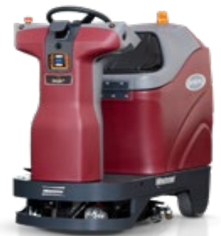
Compact and highly efficient for best cleaning results.

RoboScrub 20, the autonomous cleaning machine of the Minuteman brand, has already proven its efficiency in the field: from production halls and warehouses with many small aisles to large shopping centers. This machine ensures intuitive operation and safely navigates around complex environments. Obstacles identified by the camera systems are translated into commands by the BrainOS® technology – for example “circumnavigate obstacle” or “machine stop”. To carry out short interim cleaning applications, RoboScrub 20 can also be used as a conventional ride-on scrubber-drier. Sophisticated safety concept The flashing beacon indicates an autonomously working machine. In case a critical situation occurs despite the integrated obstacle detection, emergency buttons next to the flashing beacon and on the operating panel allow rapid and uncomplicated stopping of the machine.